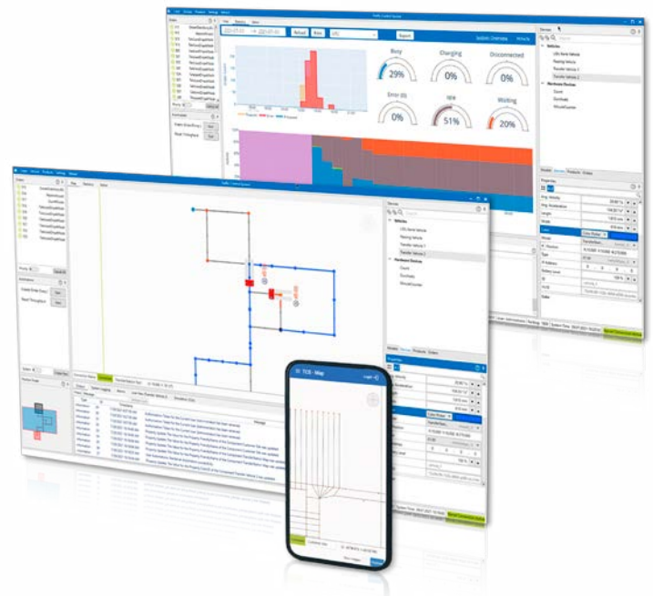
Informative analysis tools. Fleet efficiency at a glance – graphic al heat maps and comprehensive statistical data analysis

Hall plans don't always match reality and only represent empty spaces without installations, furniture or movable objects. SIGMATEK therefore provides TCS the option of importing real data, so that the map can be adapted to the actual conditions. These can be recorded by AMRs during navigation using the contour-guided SLAM method (Simultaneous Localization and Mapping). For this purpose, SIGMATEK has developed the real-time locating software SlamLoc.